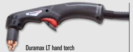
Duramax LT hand torch