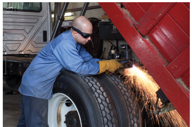
Vehicle repair and modification